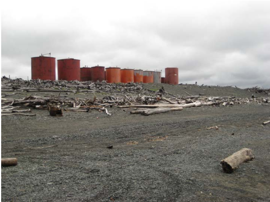
Photo 1: Shaktoolik tank farm threatened by wave-driven driftwood and erosion