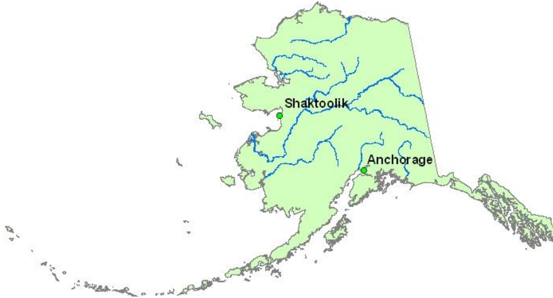
Figure 1. Location of Shaktoolik

Shaktoolik, (shock-TOO-lick), is located on the east shore of Norton Sound 125 miles east of Nome and 33 miles north of Unalakleet in the Cape Nome Recording District in the Unorganized Borough. It lies at approximately 64.33 degrees North Latitude and - 161.15 degrees West Longitude. (Sec. 23, T013S, R013W, Kateel River Meridian.) The community spans 1.1 square miles of land and 0.0 square miles of water. Shaktoolik experiences a sub-arctic climate with maritime influences when Norton Sound is ice-free, (generally May to October). Temperatures range from -50 to 87 degrees Fahrenheit. The sale or importation of alcohol is banned in the village.